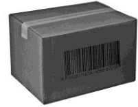
1 bar code / shop assistant