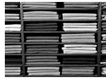
checkout / shelves