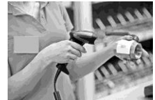
3 fit / scan