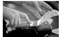
5 label / receipt