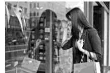
2 changing room / window-shopping