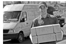
4 deliver / exchange