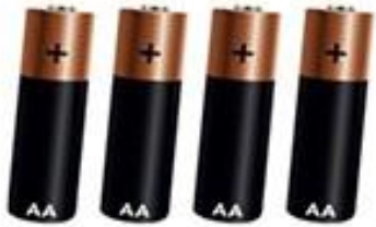
4 X AA Batteries